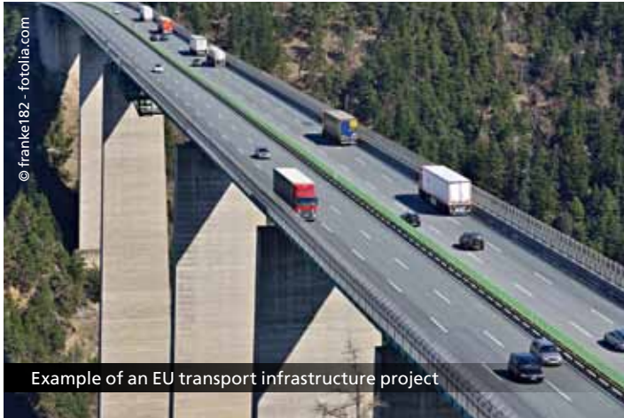
Example of an EU transport infrastructure project

The integration of Europe is continuing at a steady pace. Where exactly do infrastructures need to be upgraded or newly developed though? And how is investing in transport infrastructure connected to competitiveness and the economic growth of individual EU countries? The European Commission launched the I-C-EU project in