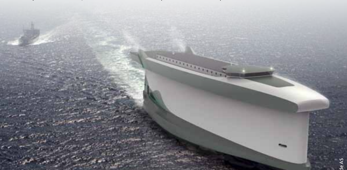
Sailing freighter Vindskip™

In order to find the best sailing route for the wind-induced drive, Fraunhofer CML is developing a customized weather routing module. Using meteorological data and navigation algorithms, this module contributes to making the best possible use of prevailing wind conditions. Additional information is available at www.ladeas.no .